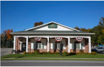
Located at Marilla Community Center 1810 Two Rod Rd, Marilla NY 14102

Memorial Day Parade Sunday - May 27th 1 pm